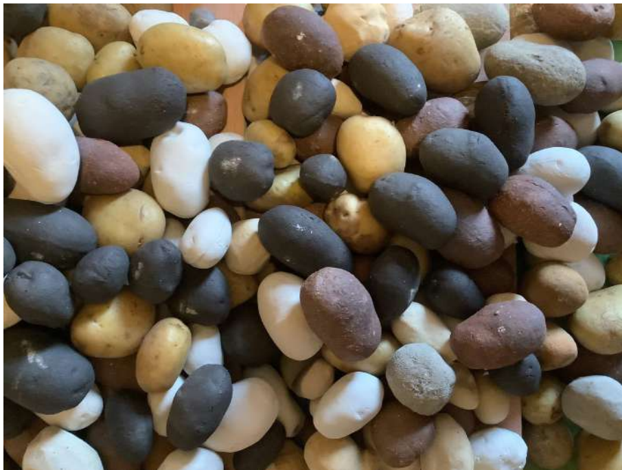
Image : Jean-Paul Thibeu, détail of ‘ Méta-radeau de la Traverse ’, 2023