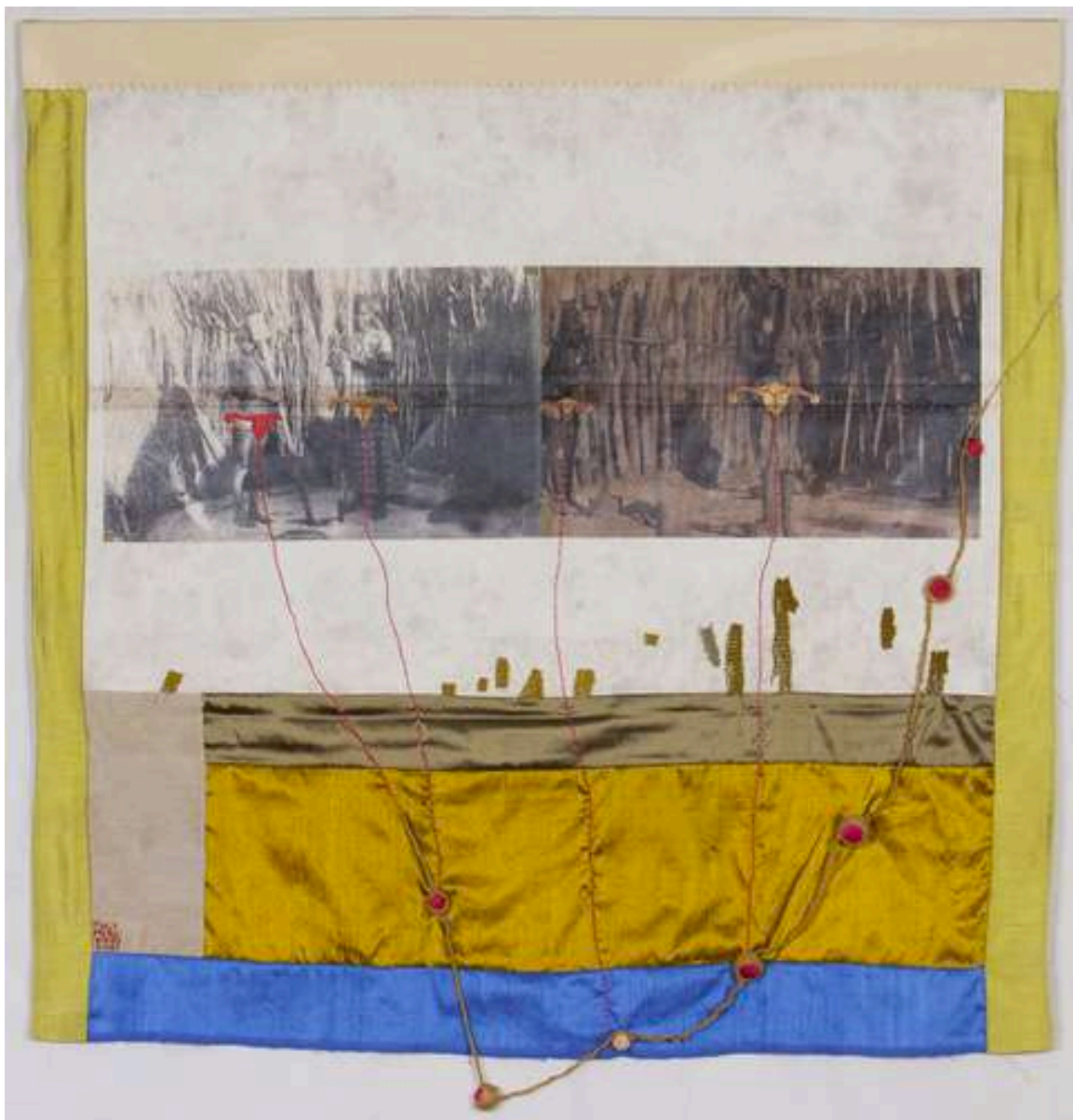
Image : Tuly Mekondjo, "Meekulu tu tula omwenyo / Grandmother revive us" , 2021, private collection, London