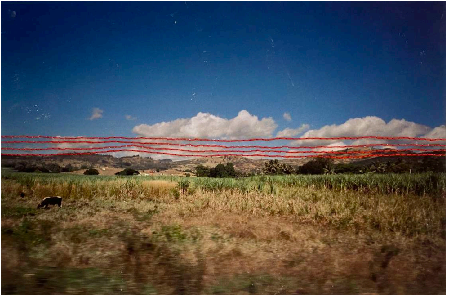
Image: Shivanjani Lal, '4 Lines Across a Horizon – Ba', 2021, courtesy of the artist