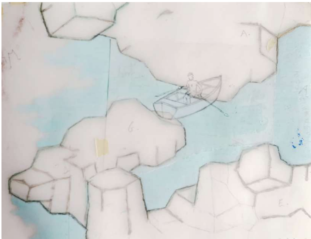
Image: Francis Alÿs, 'Untitled', 2007, Private collection, Saint-Ouen.